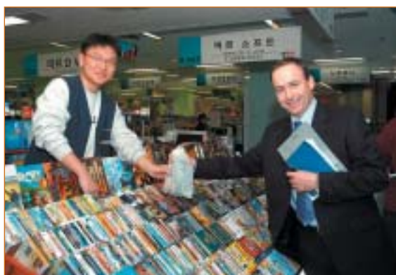
Micheál Martin, Minister for Enterprise, Trade & Employment visits Technomart during a trade mission to Japan & Korea in November 2004.