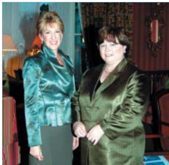
The Tánaiste, Mary Harney T.D. & Carly Fiorina, Chairman & Chief Executive Hewlett-Packard at the EU Competitiveness Council Meeting, Dromoland Castle

Ireland's Presidency of the European Union formed a central focus of the work of the Department during the first half of 2004. The Department was directly involved in the work of three of the nine formations of the Council of Ministers, namely the Competitiveness Council; the Employment, Social Policy, Health and Consumer Affairs Council; and the General Affairs and External Relations Council for matters relating to trade.