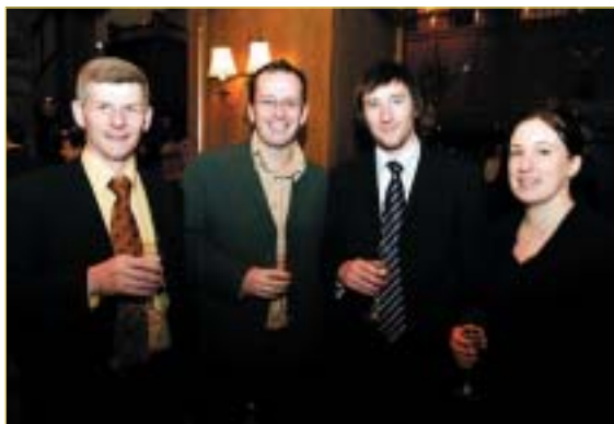
Staff of the Department at the "Best Companies to Work For in Ireland" Awards.

The Department was listed as one of the 50 best organisations to work for in Ireland in 2004. The "Best Companies to Work For in Ireland" competition forms part of a European Commission initiative designed to draw attention to the many progressive workplaces throughout Europe, both in the public and private sectors. In taking this initiative, the Commission aims to raise workplace standards throughout Europe by promoting healthy competition among organisations as they seek to be among their nations' and Europe's best workplaces.