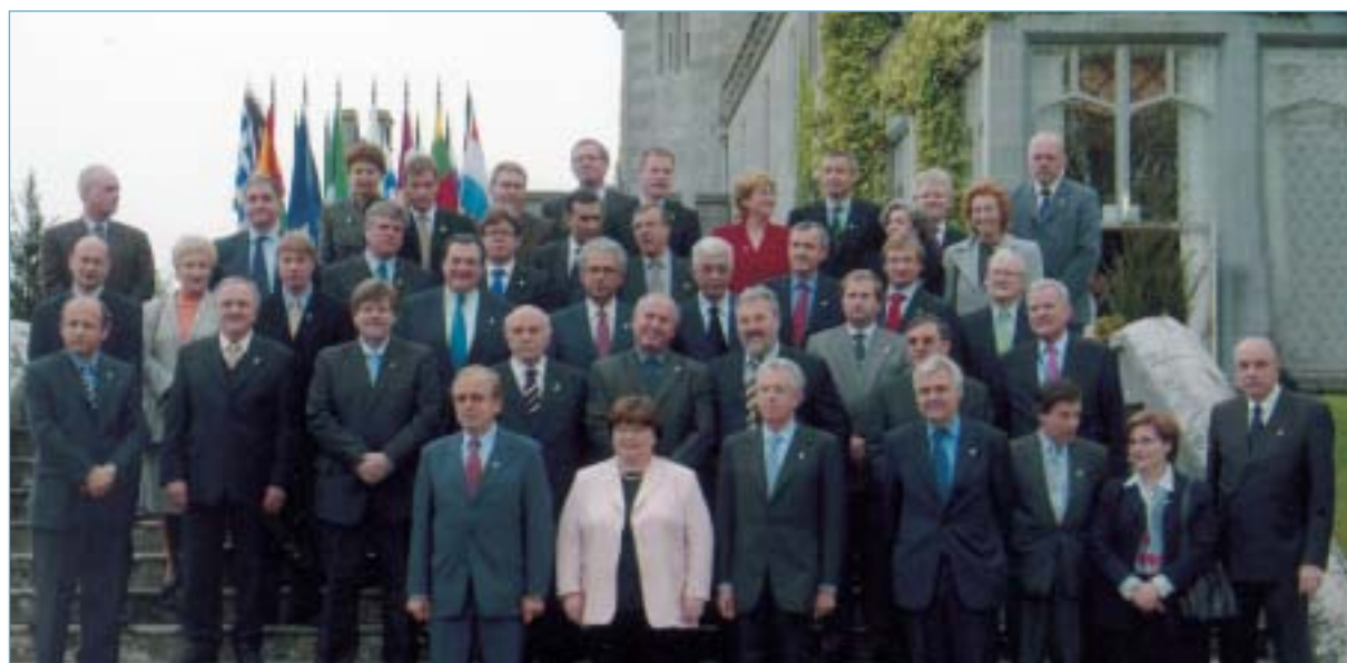
The Tánaiste, Mary Harney T.D. & her European colleagues at the EU Competitiveness Council Meeting, Dromoland Castle