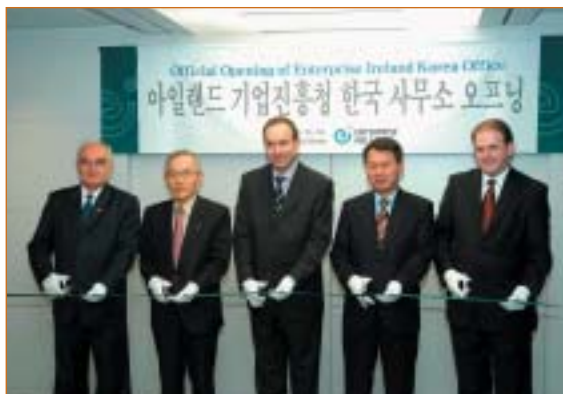
Micheál Martin T.D., Minister for Enterprise, Trade & Employment at the official opening of Enterprise Ireland's Korea Office.

Enterprise Ireland initiated over 9,000 client buyer introductions during 2004. Additionally 21 trade fairs were held, which facilitated new market opportunities for 199 clients. These activities contributed to the establishment of over 800 customer, distributor or partner deals.