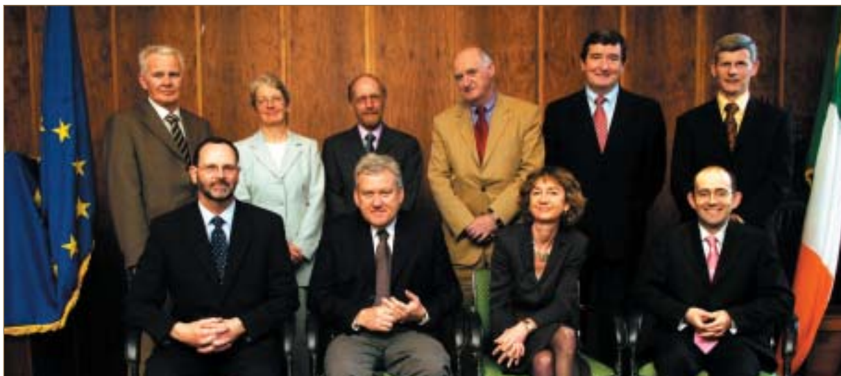
Department's Management Board