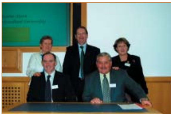
Michael Aherne, T.D. Minister for Trade & Commerce attending the signing of two business agreements between two Irish and two Newfoundland companies.

This policy document details the approach of the Government to trade development and the respective contribution that all sectors make in achieving established objectives. It also describes the mechanisms and processes in play, within both the European Union and the World Trade Organisation, to formulate or refine policy in the interest of having a global situation that underpins increased free and fair trade flows. The commitment of the Government to reforms that will support and favour economic growth in less developed countries of the world is also dealt with in some detail in the review document.