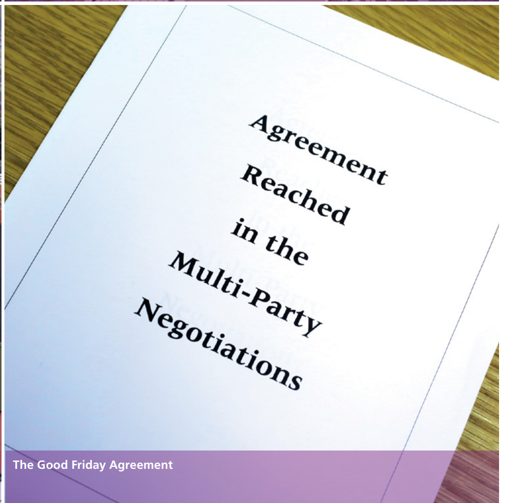
The Good Friday Agreement