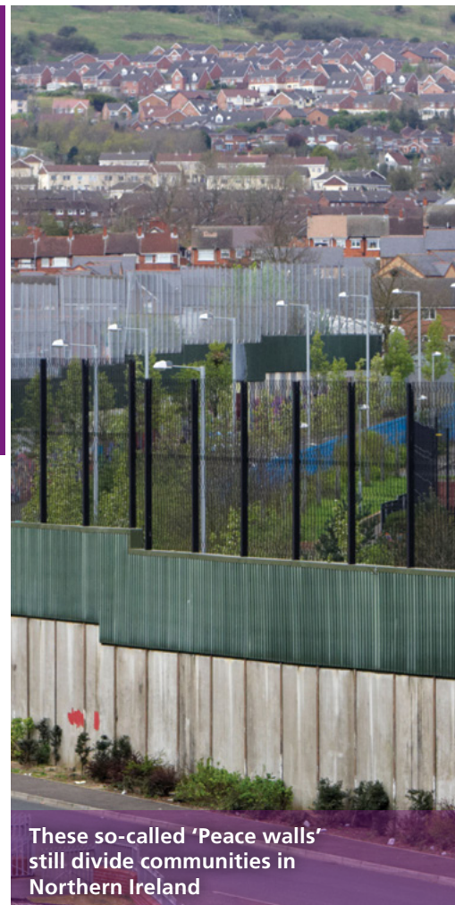
These so-called 'Peace walls' still divide communities in Northern Ireland

People in Northern Ireland entitled to Irish citizenship