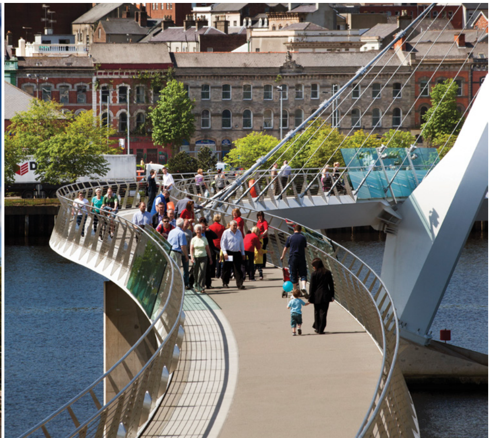
The Peace Bridge across the River Foyle, part-funded by EU Peace Programme