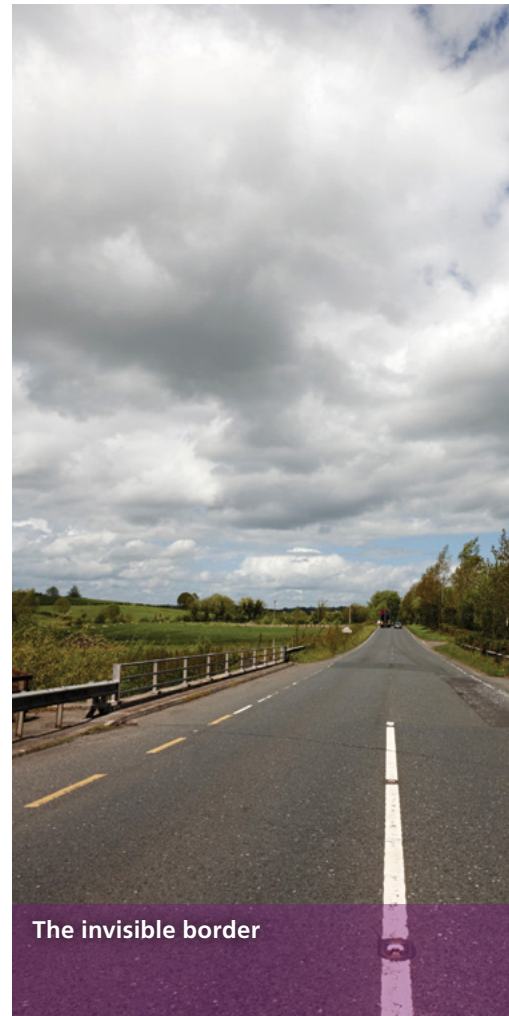
The invisible border

The Good Friday Agreement (also known as the Belfast Agreement) of 1998 remains the foundation of the Northern Ireland Peace Process and brought an end to more than 30 years of violent conflict. British and Irish common membership of the EU was a significant enabling factor in securing peace, and the European Union has played an important role in consolidating that peace and supporting reconciliation. Protecting the gains of the Peace Process and reflecting the unique circumstances of Northern Ireland throughout the Brexit negotiations are clearly in the interests of both the EU27 and the UK.